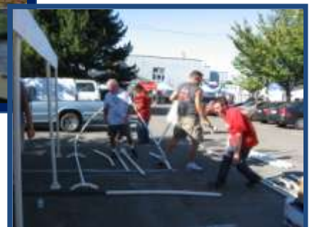
ROTC Mariner High School Students – YEA!