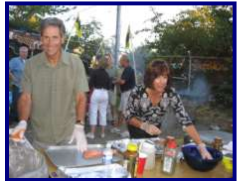
and eager assistants...