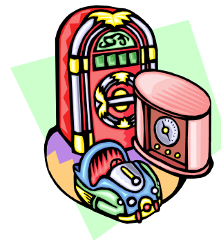
Rock around the clock with Snohomish Kiwanis Saturday November 13, 2004

not required. Tickets will be $30 each. There will be raffles and other prizes. Please join your fellow Kiwanians to celebrate this historic event and get a chance to relive your misspent youth.