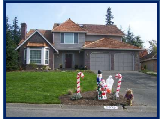
This is what happens to your house when you're away and don't make it to the Garage Sale.