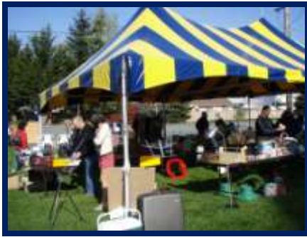
ANOTHER SUCCESSFUL GARAGE SALE!!