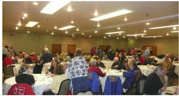
Kiwanians, from Zone E, gathering in Mt. Vernon

This year’s Zone E conference was held at the Cottonwood Conference Center in Mt. Vernon. About 170 Kiwanians from Zone E attended this educational and informative conference. We not only saw our Division 22 compatriots from Snohomish, Tillicum, and Lynnwood, but had the opportunity to meet friends from other Snohomish County clubs, clubs from Skagit and Whatcom as well as British Columbia.