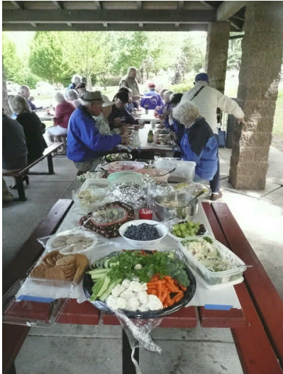
Just some of the tasty dishes we were treated to at our annual picnic in the park.