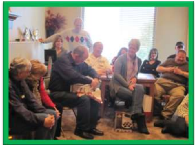
Lots of cool stuff at the gift exchange